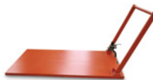
Aero-Pallet with optional heavy duty U-handle